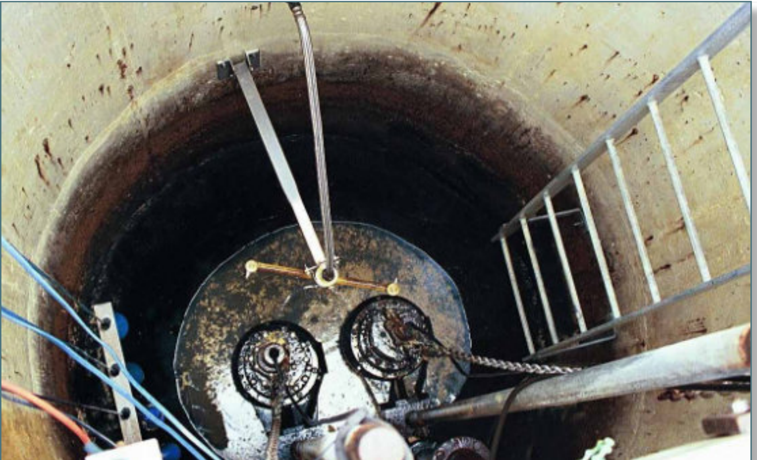
AUTOWELLWASHER™ IN PUMP STATION ON WALL MOUNT BRACKET