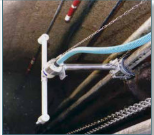
AUTOWELLWASHER™ ON GUIDE RAIL BRACKET