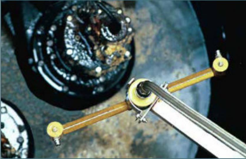
AUTOWELLWASHER™ IN PUMP STATION