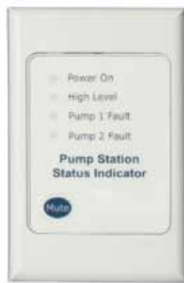
FPC - 30100