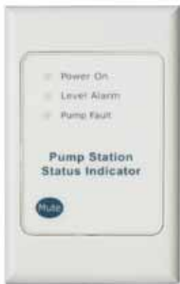
FPC - 15100